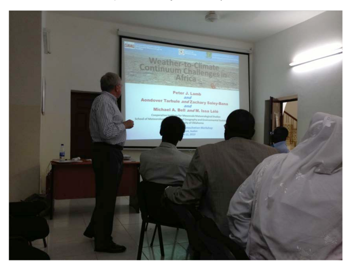
Lecturing during the opening of the RWX Workshop (June 2013) in Khartoum (Sudan).