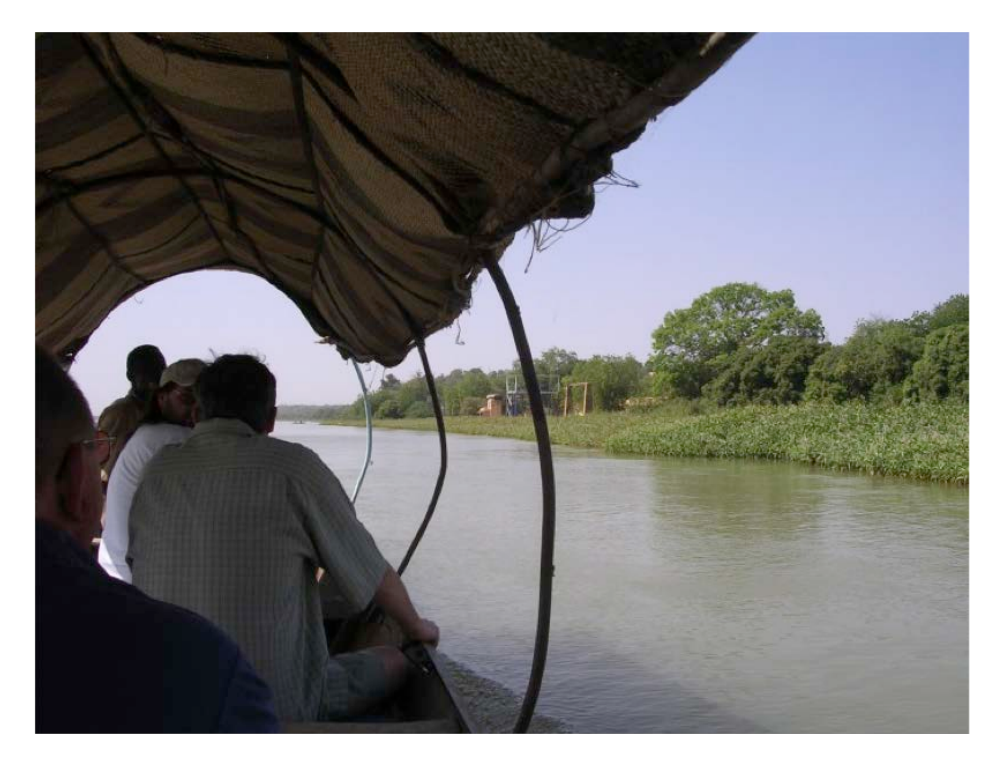
A trip on the River Niger near Niamey (2006).