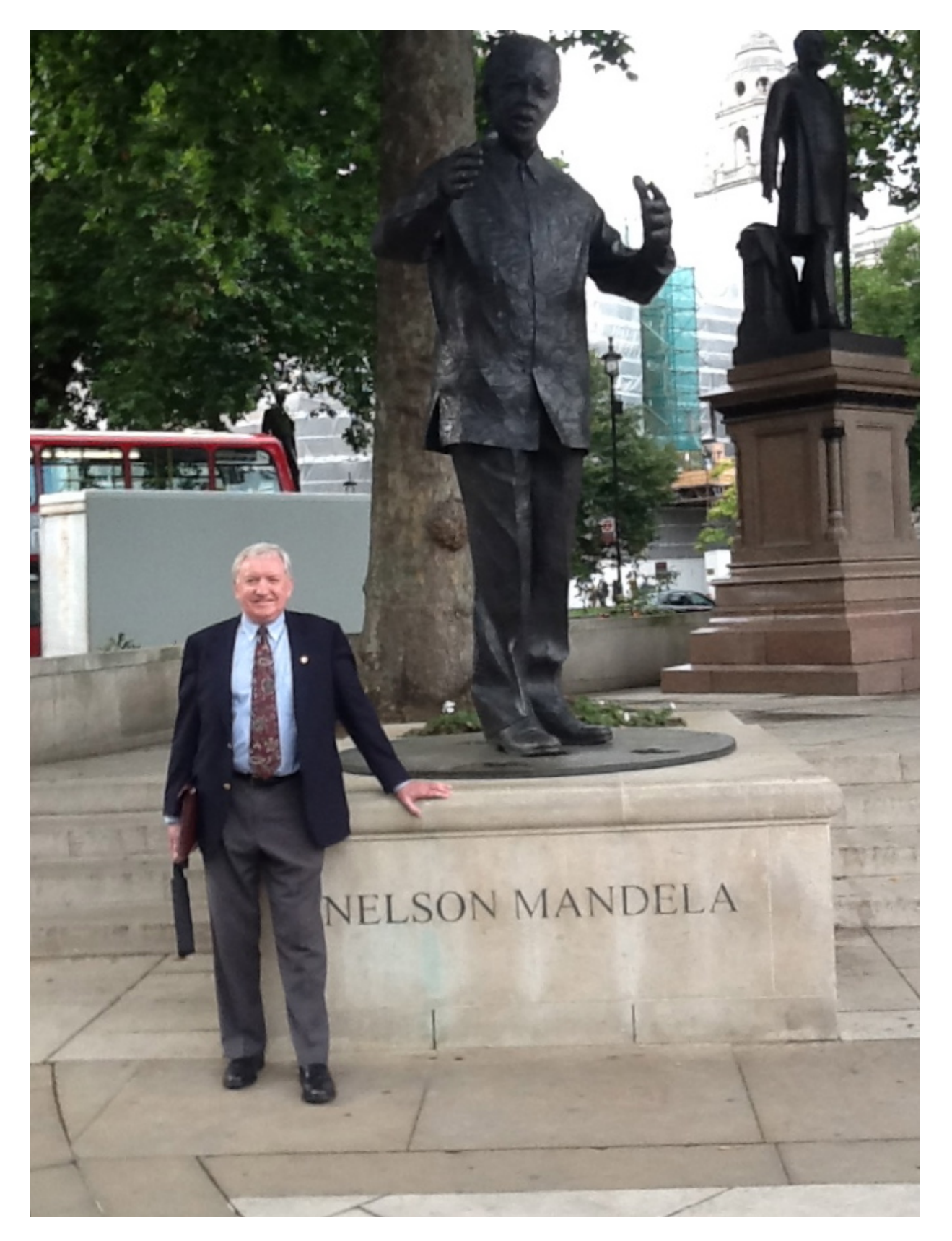
Parliament Square, London – September 2013